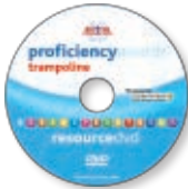
resource dvd (Windows compatible)

Registered in England No. 2646569 VAT Reg No. 594 0695 06