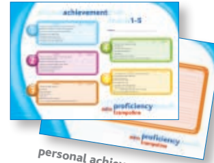
personal achievement charts